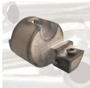
Tool holder optional