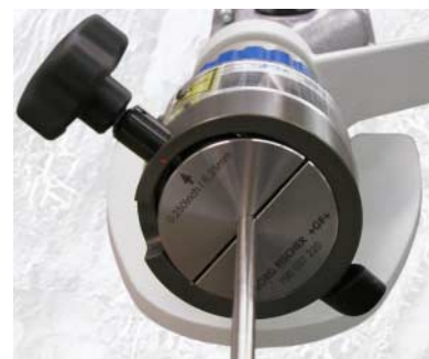
Quick clamping system for tubes

GEORG FISCHER +GF+ Excellence in Pipe Tools