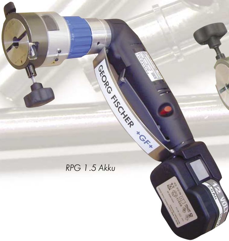
RPG 1.5 Akku