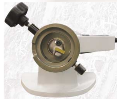
QTC® Quick Tool Change