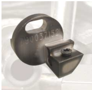
Standard tool holder

The technical data are not binding. They are not warranted characteristics and are subject to change. Please consult our General Conditions of Supply.