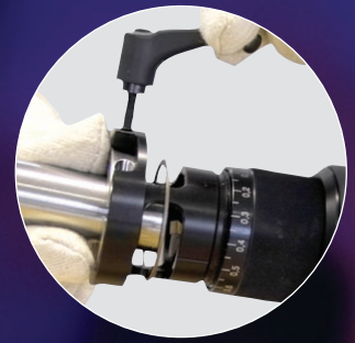
Quick Clamping System